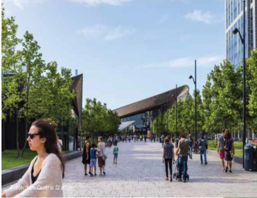
Rotterdam Central Station